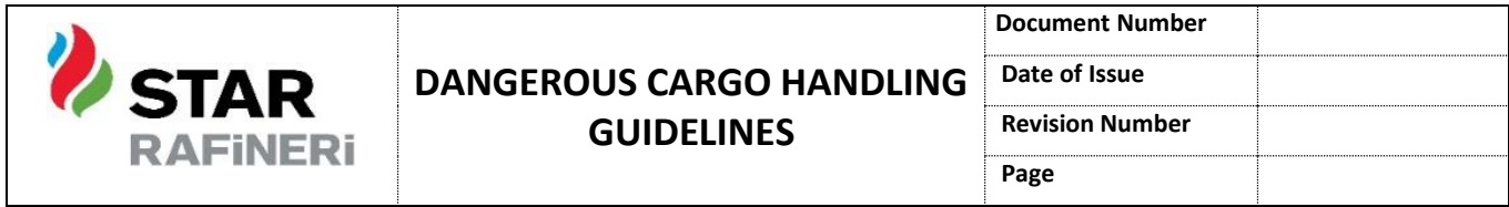
Table for Classification of Dangerous Cargo